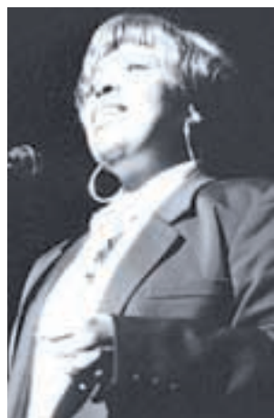
Roberta Flack will introduce musical acts at Central Park's Naumberg Bandshell at 2 p.m.