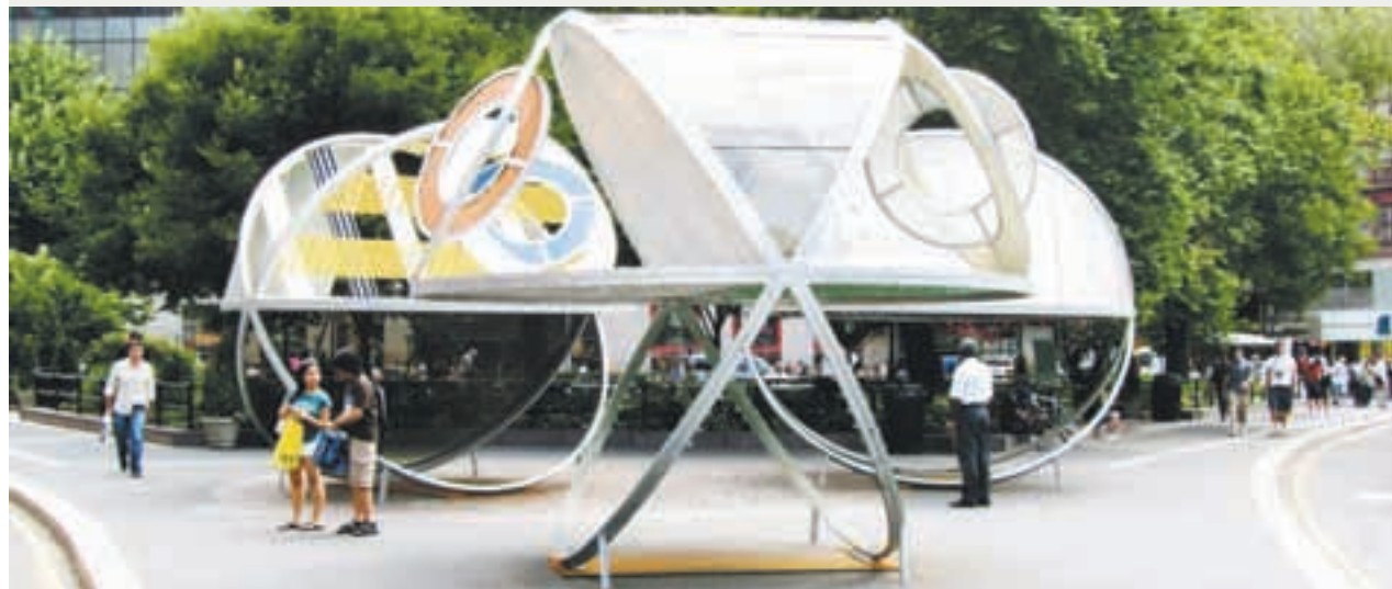
“Tumbling Mirages,” a public art installation by Dennis Oppenheim, will be on display at the southeast triangle of the park through Nov. 9 as part of the city's art initiative. Oppenheim's piece consists of three gigantic 15-foot-wide steel spheres.